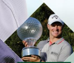
2016 Winner Alexander Noren

Built with multiple tees, the course can be enjoyed by golfers of all levels of skills, but even from the forward tees it remains a challenge. A distinguishing feature of the course is its greens which allow for interesting pin positions on the clover-shaped putting surfaces protected by strategically placed bunkers.