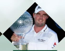
2015 Winner Marc Leishman