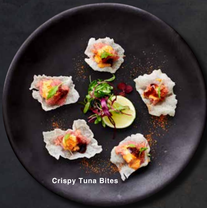
Crispy Tuna Bites

Beef Ribs 300g 116 Grilled beef ribs, basted in CTFM's special BBQ sauce