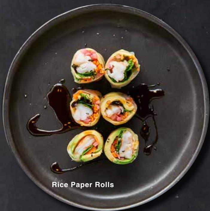
Rice Paper Rolls