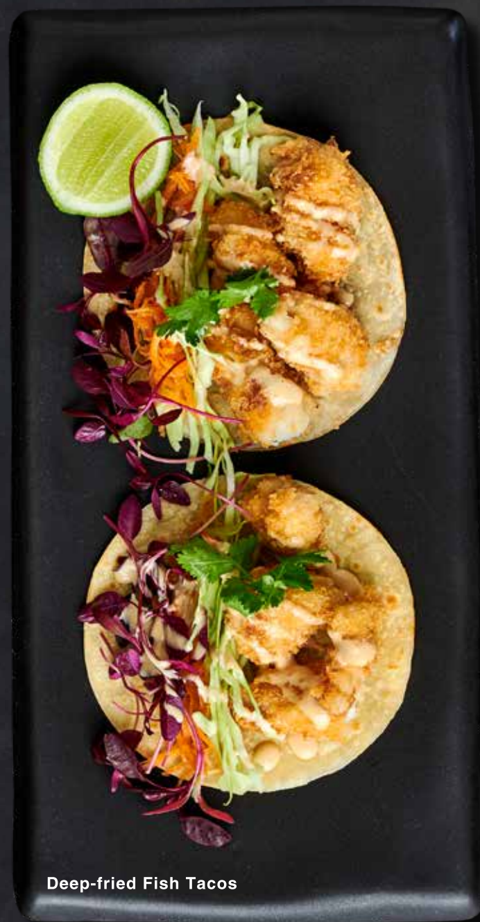
Deep-fried Fish Tacos