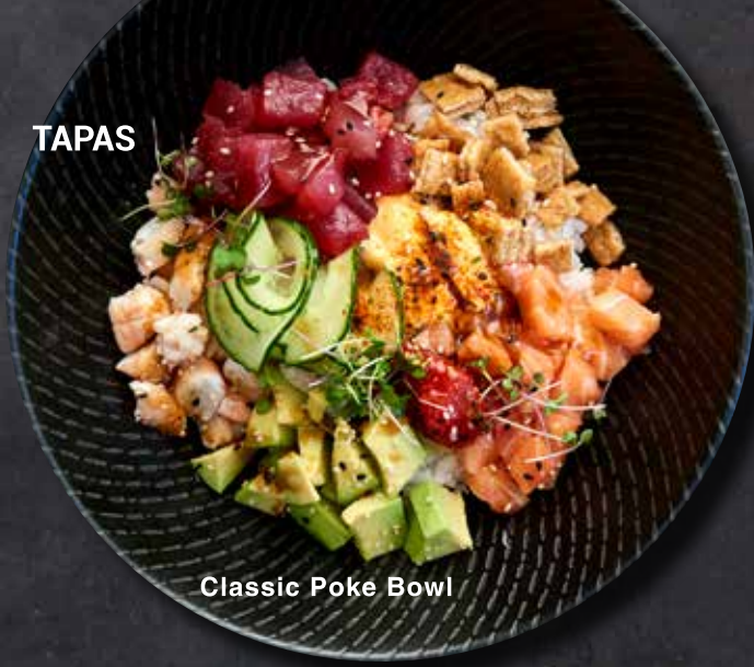
Classic Poke Bowl